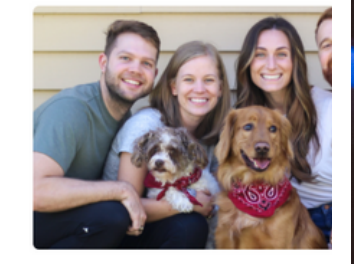
Domain Tuesdays at 7:15 p.m.