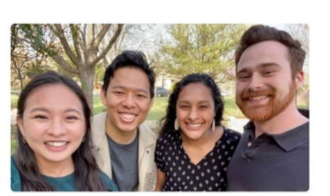
East Braker Wednesdays at 7:00 p.m.