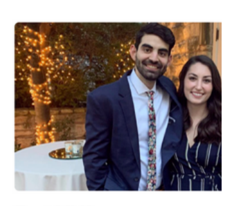
East MLK Tuesdays at 7:15 p.m.