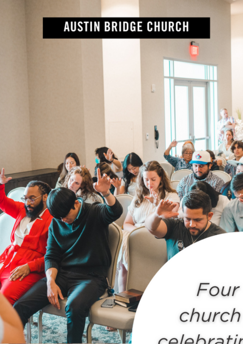
AUSTIN BRIDGE CHURCH