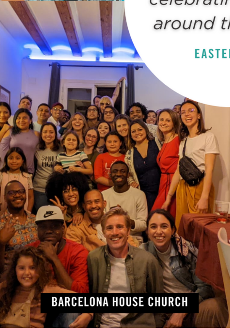
BARCELONA HOUSE CHURCH