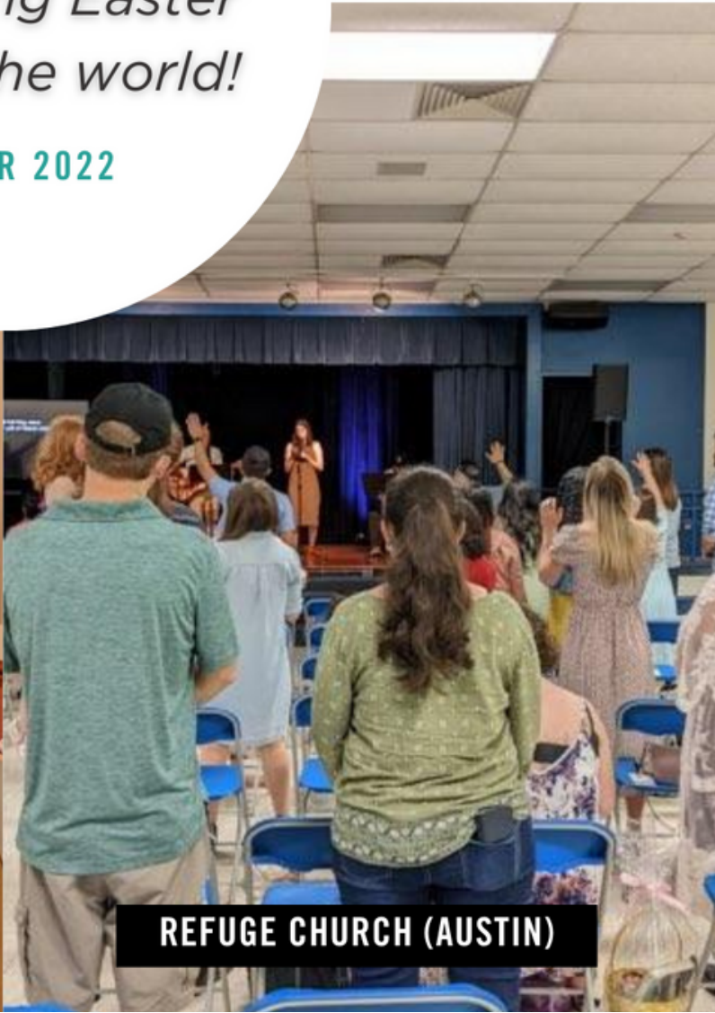
REFUGE CHURCH (AUSTIN)